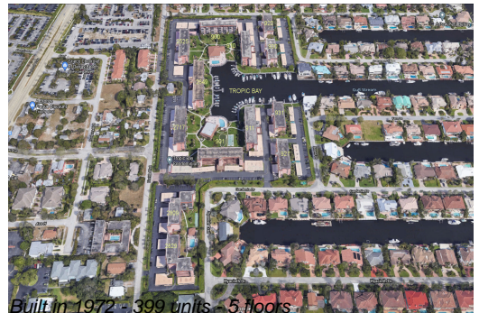
Built in 1972 - 399 units - 5 floors