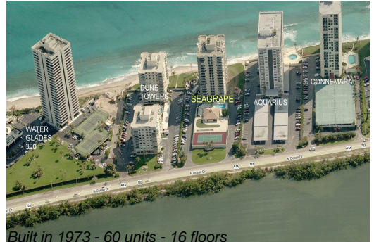
Built in 1973 - 60 units - 16 floors