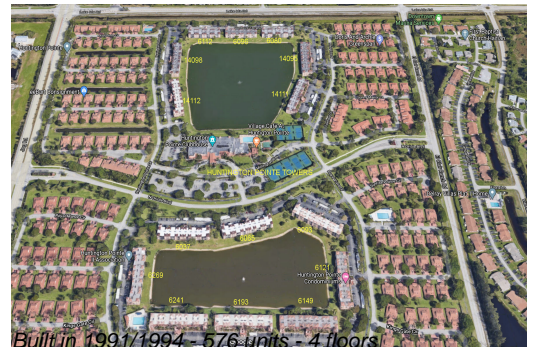
Built in 1991/1994 - 576 units - 4 floors