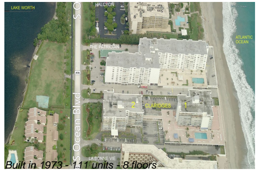
Built in 1973 - 111 units - 8 floors