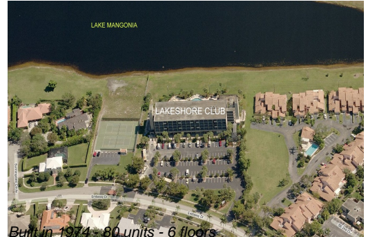
Built in 1974 - 80 units - 6 floors