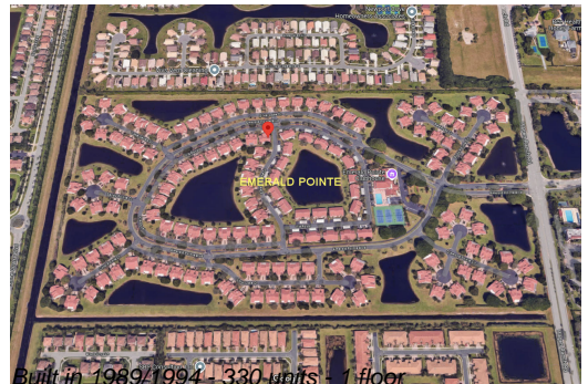
Built in 1989/1994 - 330 units - 1 floor