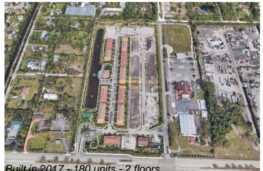
Built in 2017 - 180 units - 2 floors