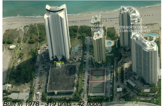
Built in 1978 - 319 units - 42 floors