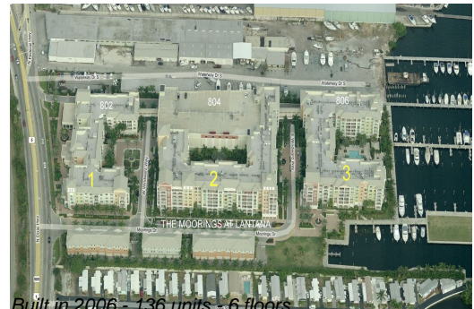
Built in 2006 - 136 units - 6 floors