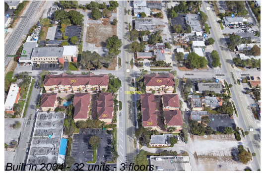
Built in 2004 - 32 units - 3 floors

The above valuated price is a baseline figure that does not take into account any specific renovation, upgrade, split, merge, or deterioration of the unit.