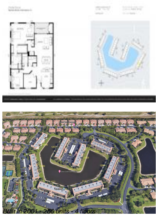
Built in 2001 = 256 units = 4 floors

Coral cove: 51 days Boynton Beach: 49 days Palm Beach: 58 days