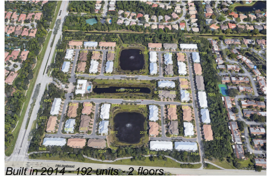
Built in 2014 - 192 units - 2 floors

MLS Number: RX-10992580 Status: Active Size: 2,589 Sq ft. Bedrooms: 3 Full Bathrooms: 2 Half Bathrooms: 1 Parking Spaces: 2+ Spaces, Driveway, Garage - Attached, Guest, Vehicle Restrictions View: Other Rental Price: $4,000 List PPSF: $2 Valuated Price: $593,000 Valuated PPSF: $296