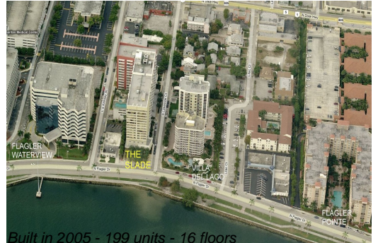
Built in 2005 - 199 units - 16 floors