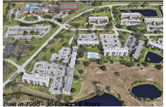
Built in 1986 - 384 units - 8 floors