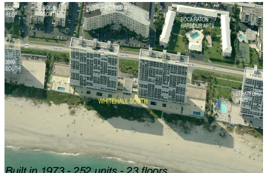
Built in 1973 - 252 units - 23 floors