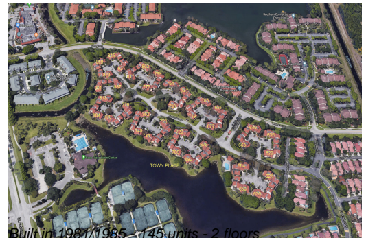
Built in 1981/1985 - 145 units - 2 floors