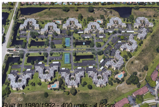
Built in 1980/1992 - 400 units - 4 floors