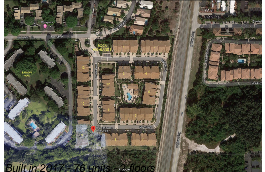
Built in 2017 - 76 units - 2 story floors