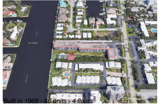
Built in 1968 - 80 units - 4 floors