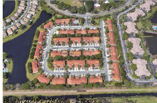
Built in 2001 - 128 units - 2 floors