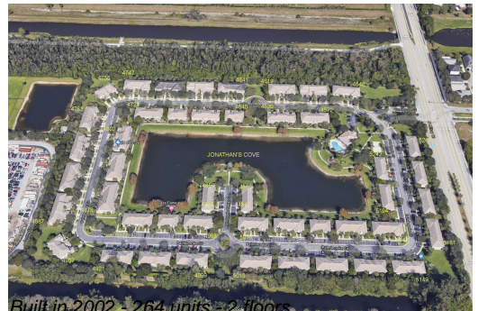
Built in 2002 - 264 units - 2 floors