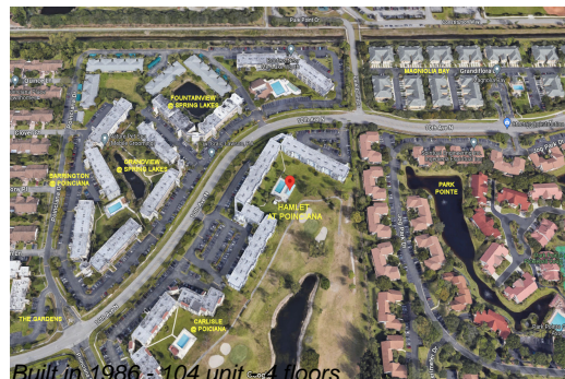
Built in 1986 - 104 unit - 4 floors