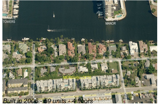
Built in 2006 - 59 units - 4 floors