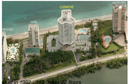
Built in 1982 - 110 units - 22 floors