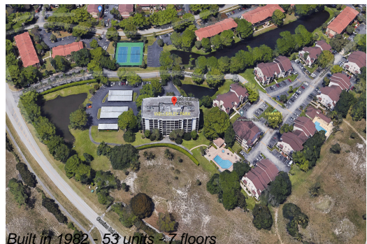
Built in 1982 - 53 units - 7 floors