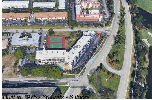
Built in 1975 - 66 units - 6 floors