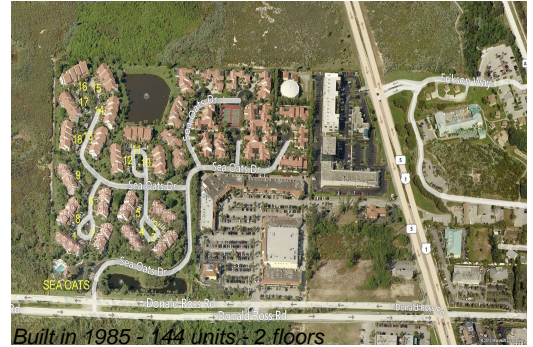
Built in 1985 - 144 units - 2 floors

The above valuated price is a baseline figure that does not take into account any specific renovation, upgrade, split, merge, or deterioration of the unit.