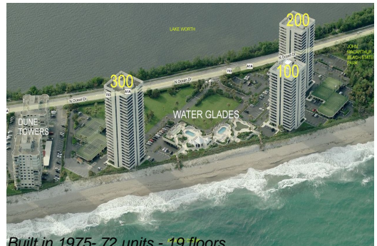
Built in 1975- 72 units - 19 floors