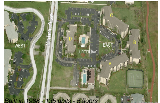
Built in 1988 - 135 units - 5 floors

http://www.jupiterbaycondoassoc.com/id63.html