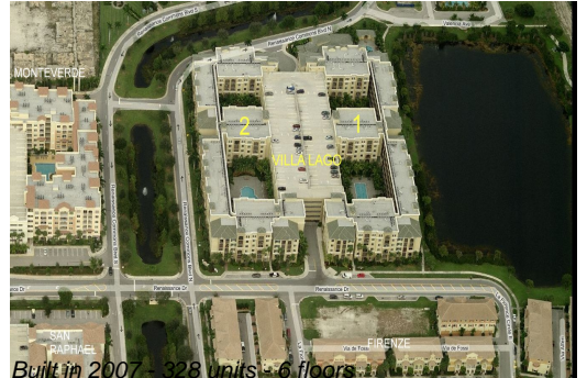
Built in 2007 - 328 units - 6 floors