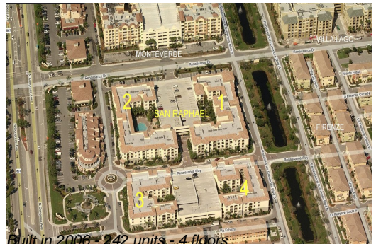
Built in 2006 - 242 units - 4 floors