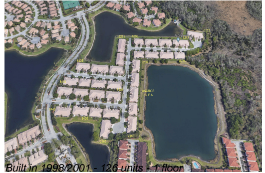
Built in 1998/2001 - 126 units - 1 floor