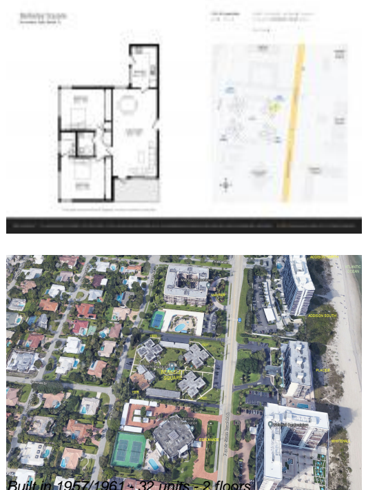
Built in 1957/1961 - 32 units - 2 floors