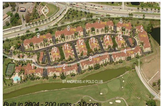
Built in 2004 - 200 units - 3 floors