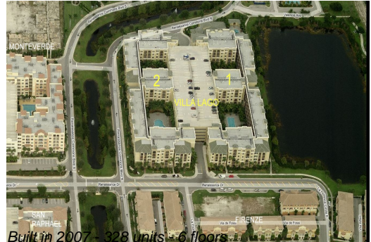
Built in 2007 - 328 units - 6 floors