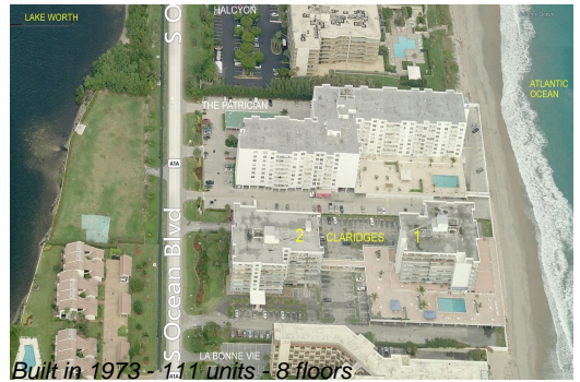
Built in 1973 - 111 units - 8 floors