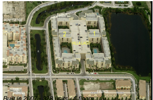
Built in 2007 - 328 units - 6 floors