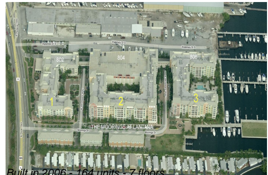
Built in 2006 - 164 units - 7 floors