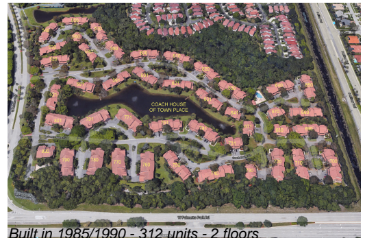
Built in 1985/1990 - 312 units - 2 floors