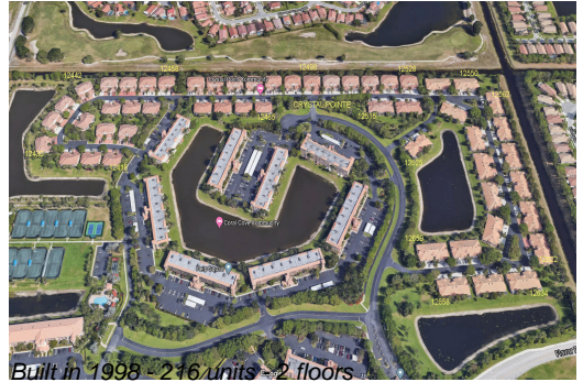
Built in 1998 - 216 units - 2 floors