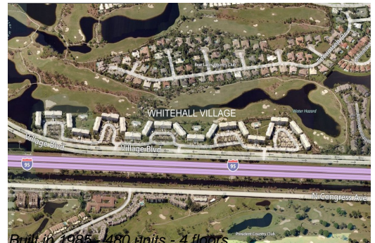
Built in 1986 - 480 units - 4 floors