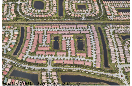
Built in 2001 - 276 units - 2 floors