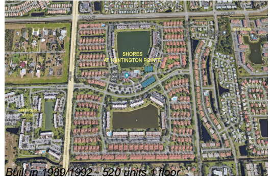
Built in: 1989/1992 - 520 units, 4 floor