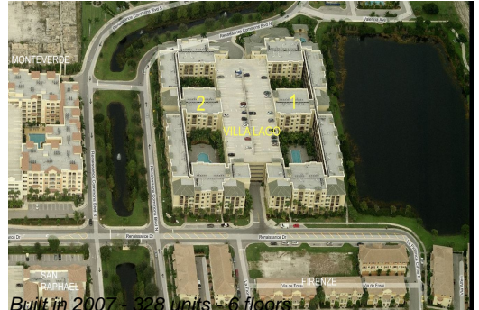
Built in 2007 - 328 units - 6 floors