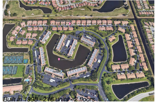
Built in 1998 - 216 units - 2 floors