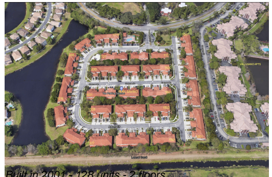
Built in 2001 - 128 units - 2 floors