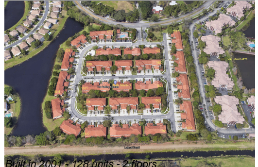
Built in 2001 - 128 units - 2 floors