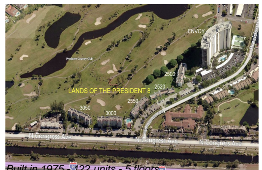
Built in 1975 - 122 units - 5 floors

Lands of the President 8: 2% West Palm Beach: 4% Palm Beach: 4%