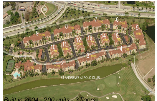
Built in 2004 - 200 units - 3 floors