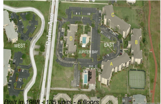
Built in 1988 - 135 units - 5 floors

http://www.jupiterbaycondoassoc.com/id63.html