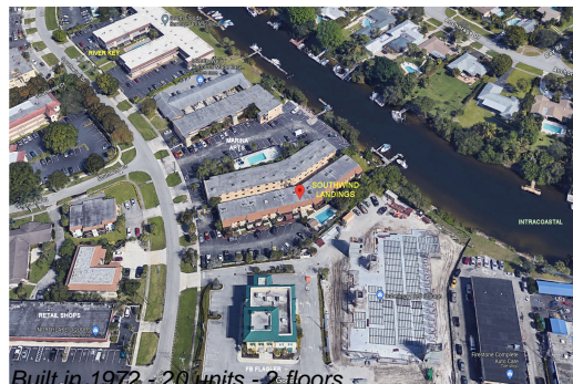
Built in 1972 - 20 units - 2 floors